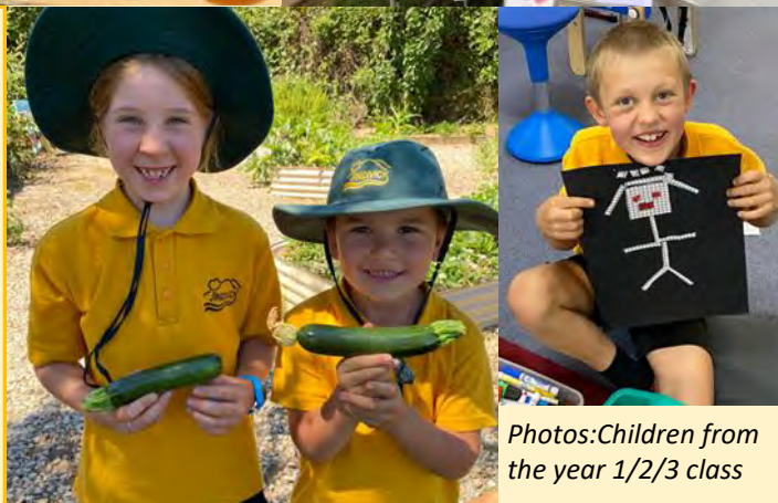
Photos: Children from the year 1/2/3 class

We're off to a fantastic start this year at Jindivick Primary School ! Our students have been making the most of the sunshine, taking part in Clean Up Australia Day to help keep our school grounds looking great. We also enjoyed a wonderful annual school picnic with our families—always a highlight of the year!