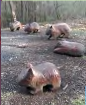
Work on the safety fence for the playground at Kidd Parke Reserve and the bollards around the picnic area.