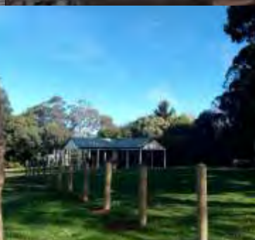
This area is available to be used whilst the remainder of the work are carried out at the playground opposite the school.