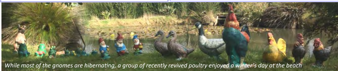
While most of the gnomes are hibernating, a group of recently revived poultry enjoyed a winter's day at the beach

Contributed by the Friends of Drouin's Trees