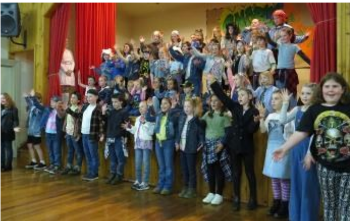
Top: Whole school performing 'We Are Australian'

The Jindivick Primary School Soiree is back! On the evening of Thursday 8th of September the whole school performed in front of a full house at the Jindivick Hall. The students were amazing and had lots of fun dressed up in their 90's outfits. In Term 4 we are looking forward to our annual Fun Run, the Junior Sports and excursions to the Immigration Museum for the grades 3 - 6's and a trip to the Cranbourne Botanical Gardens for the juniors.