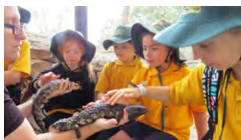
Above: Grade 3 students are fascinated by the lizards

The whole school enjoyed a great day at Gumbuya Animal Park. The students have been all working on a Sustainability Theme.