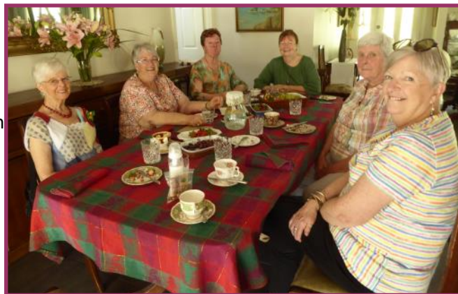
Left: Locals enjoy a leisurely community catch up and breakfast at The Jindi Caf' before rejoining the last-minute rush of Christmas preparations.