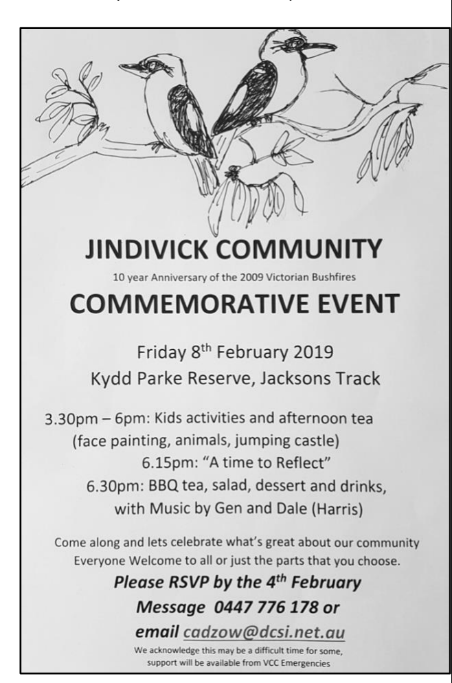
Black Saturday Memorial, Community Garden, Jindivick