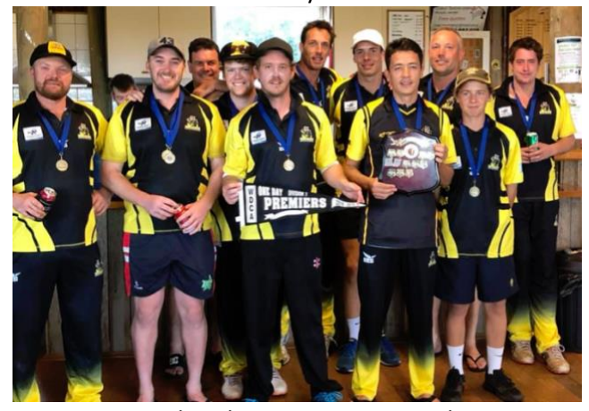
Division 3 cruised to the victory target set by Bunyip with 4 overs to spare Above: Division 3 premiers Below: Division 4 premiers

who travel great distances to enjoy our hospitality and the feel of an extended family.