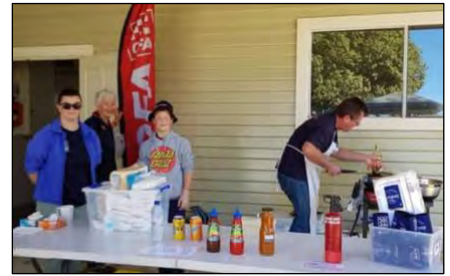
(Above: CFA stall at the Jindivick Country Market)

Drouin West CFA advises that Fire Restrictions are envisaged to start in early November. Keep an eye on local newspapers facebook, the CFA website etc for details