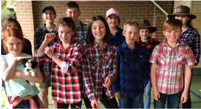
The students at Jindivick Primary are amazing!