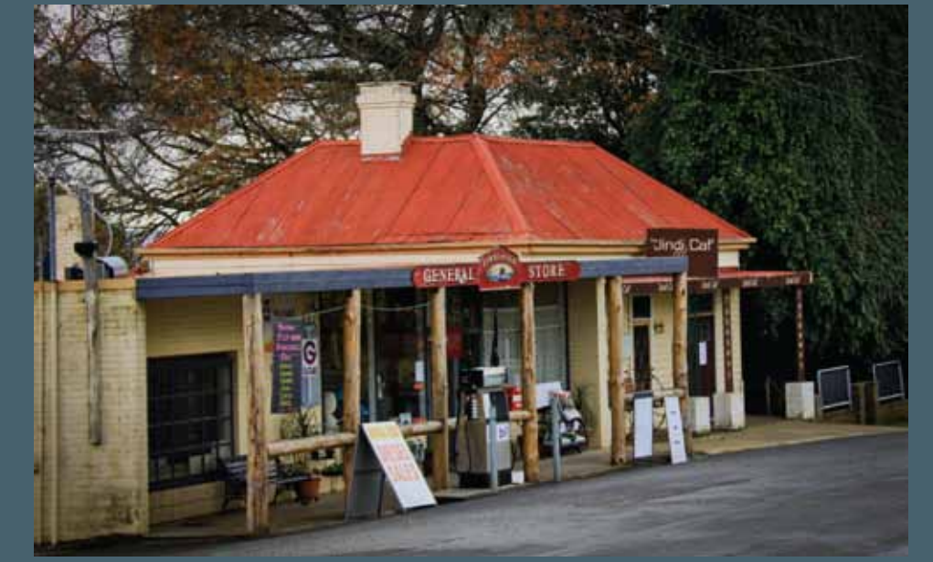
Jindivick General Store opened in 1889