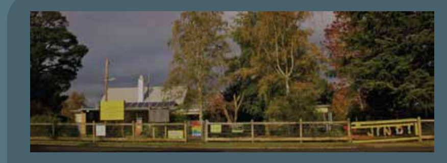
Jindivick Primary School, Number 1951. Opened in 1877