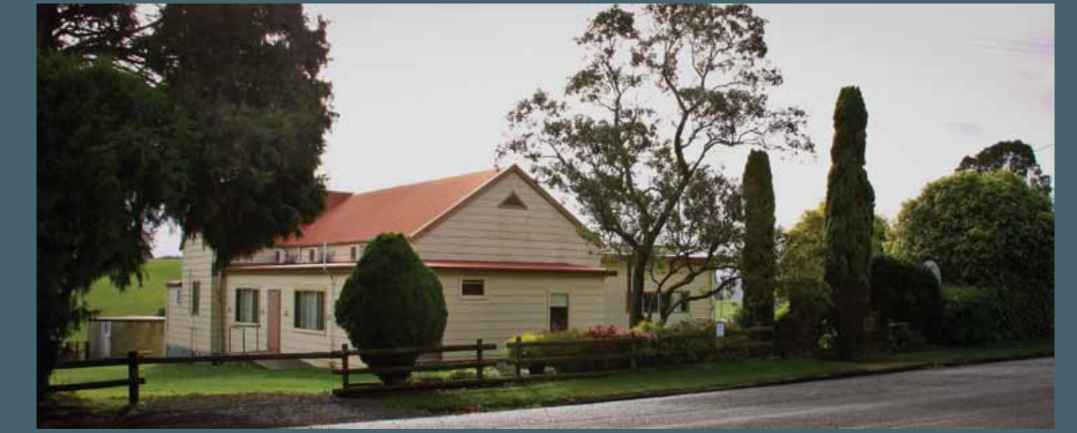
Jindivick Mechanics Hall built in 1886 Public unisex, disabled toilets at front left.