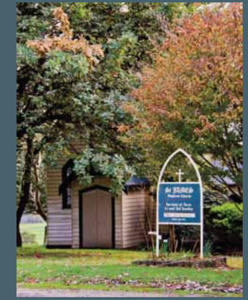
St James Anglican Church established 1882. Friendly and welcoming.